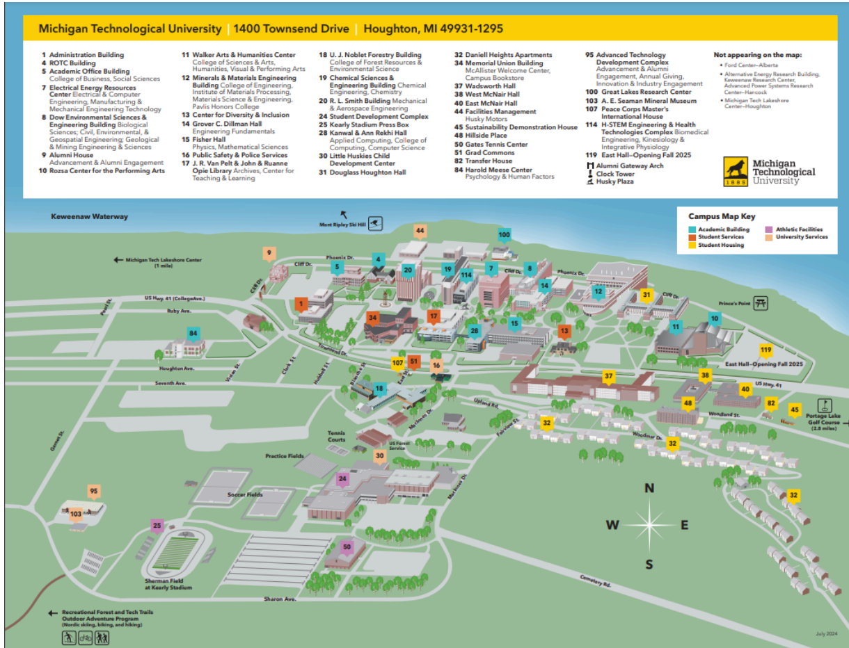
Fig. 1: Campus Map to see the layout of campus. Detailed maps of where competitions and events will be happening will come out later in mailer 3.