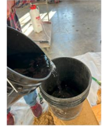
Step 10 : Dump water in the bucket to fail the tunnel