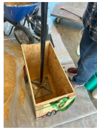
Step 2 : Fill sand and compact to form 1 in. thick bedding