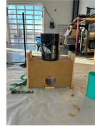
Step 9 : Place 5-gallon bucket on the top of the tunnel