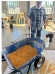
Step 1 : Spray water on sand and mix