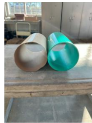
Step 3 : Prepare paper sleeve for the pipe