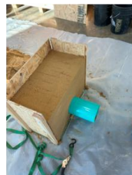
Step 8 : Push out the PVC pipe