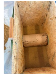
Step 4 : Spray oil between paper sleeve and pipe and install it