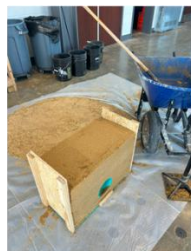
Step 7 : Construction completed