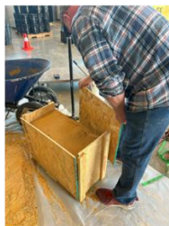
Step 6 : Remove front and back walls of the wood box