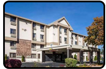
Quality Inn Salt Lake City Downtown

More information can be found on the website: Quality Inn