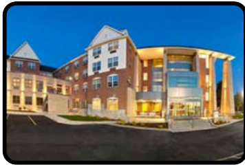
University of Utah Guest House

Note: It is the responsibility of each attendee to reserve and pay for their own accommodations.